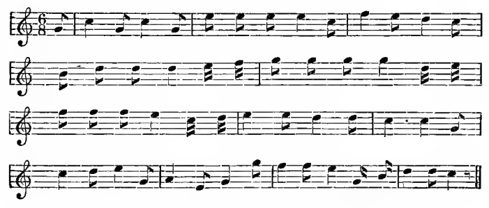
" Dé zabs, dé zabs, dé counou ouaïe ouaïe, Dé zabs, dé zabs, dé counou ouaïe ouaïe,

"That boat song, do you mean, which they sing as a signal to those on shore?" He hummed.